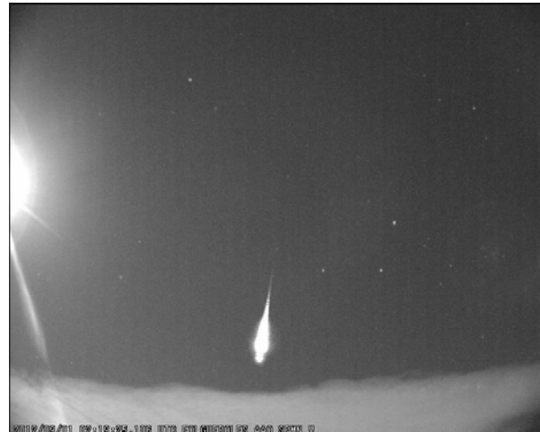
Figure 4. Composite image of a -9 magnitude Aurigid bolide recorded from Folgueroles station on Sept. 1 st 2012 at 02h19m24.8s UTC (SPMN 010912). The summer triangle is clearly seen around the image center while the full Moon is visible in the left border. It is a good example of cameras capabilities.

other solar system bodies, but usually are recovered without information regarding their progenitors. Our effort tries to increase the available number of recovered meteorites with orbital information. Such information is crucial to better understand the dynamic processes behind the delivery of meteorites to Earth. Recent results suggest that the main asteroid belt might not be the only source, Near Earth Objects (NEOs) and Jupiter Family Comets (JFCs) populations may also be significant. We hope that our common effort provide new scientific highlights in this regard.