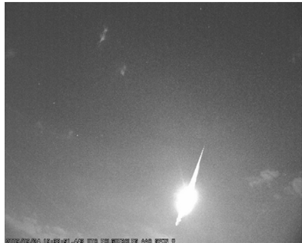
Figure 1. A composite image of a -12 magnitude sporadic bolide recorded from Folgueroles station on Sept. 24 th 2009 at 19h38m50.8s UTC (SPMN 240909). The fireball luminosity produced a reflection in the internal lenses (see the light tracks appeared on the upper part of this image).

Preliminary results and discussion: The stations are continuously monitoring the night sky and then provide direct information on the meteor and fireball activity. Arrival of large meteoroids is noticed by extremely bright fireballs (Fig. 1-3). Detection of meteor outbursts has been also achieved with the example of an interesting Aurigid (AUR) outburst detected in 2012 produced by a unexpected dust trail of comet C/1911 N1 Kiess (see a bright AUR bolide in Fig. 4). Detection of extremely bright bolides gives clues on the origin of meteoroid streams produced in unusual ways, like e.g. after cometary breakups. That was the case of fireballs detected from several meteoroid streams [3-4].