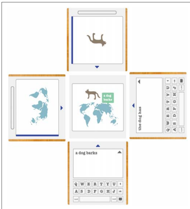
Figure 3: Visualization of the Square1 November 2012 prototype (by Anna Keune).

In the participatory design phase of the research-