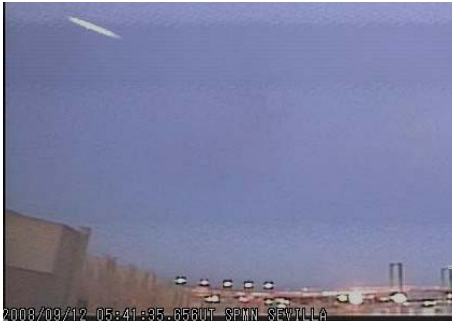
Fig. 4. A daylight fireball imaged with a color video camera from Sevilla SPMN station. The event took place on Sept. 12, 2008 at 5h41m35.6s UTC.

By using that dynamic procedure we have obtained evidence that some NEOs could be a source of meteorites. We found that NEO 2002NY40 was probably the source of at least two of three bright bolides recorded from several stations by the Finish and Spanish Fireball networks in 2006. These meteoroids were forming a complex with other NEO called 2004NL8 that would be a source of LL chondrites to the Earth [6]. We suggested that the origin of this complex would be the disintegration of a progenitor asteroid during a close approach to the Earth or Mars, but several scenarios are open [16].