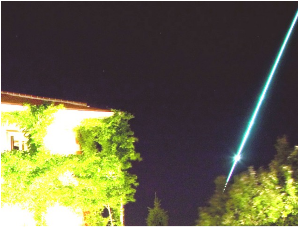
Fig. 5. The Béjar superbolide photographed from Torrelodones (Madrid) by Javier Pérez Vallejo.

Although catastrophic disruptions of comets are relatively frequent, it is obviously that having the debris left by the disruptive events crossing the Earth's orbit a short time after the disruption is a much rarer event. The probability of having the correct geometry for this is small, but fortunately not zero. The opportunity to study such an event is expected over the next few years [23]. Comet 73P/Schwassmann-Wachmann was observed suffering progressive disruption between 1995 and 2006, while encounters with these dust trails will occur in 2011, 2017, and 2022. The meteor shower associated with this comet produces weak meteor rates, but fireballs have been frequent in the last few years. The best geometric conditions to observe the recent debris from the 1995 disruption will occur on May 31, 2022 (Table 6g of [23]). A global campaign to study this shower over the years up to 2022 would provide very important clues on the demise of comets. In particular, a study of the physical properties (bulk density, dynamic strength, etc...), and composition of the fireballs would yield important information regarding the decay products and their subsequent evolution such as whether the fragments suffering a disruption cascade until becoming mm-sized meteoroids, or will some survive and remain as meter-sized bodies?