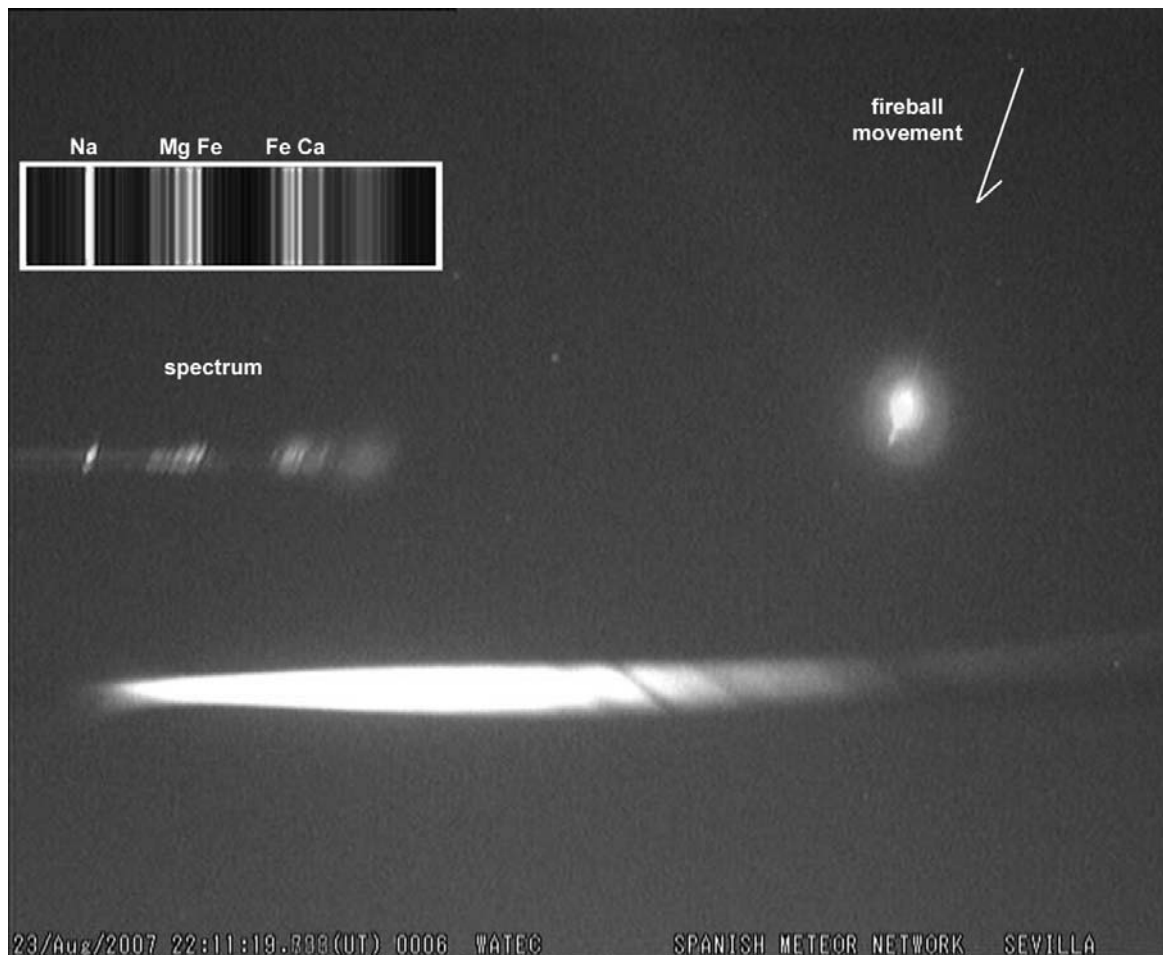
Fig. 6. Ending flare produced by the disintegration of -8 magnitude fireball Trigueros (SPMN230807). The spectrum of the flare appears on left. Note that the bright Moon spectrum appears below it. The calibrated spectrum is shown in a window over the spectrum, where the main elements contributing to the emission lines are given. The abundance ratios of the main-forming elements of the meteoroid were obtained. For more details [28]