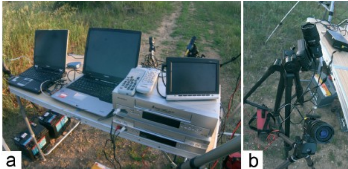
Fig. 3. A mobile SPMN recording station. a) System control table. b) Different sound and video detectors.

Khartoum has recently recovered meteorites from this event [10]. This case is very important because the impact of the progenitor meteoroid was forecasted for the first time, but in addition a precise heliocentric orbit was achieved on the basis of the 20-hours global monitoring of this object. The recovered meteorites are also the first obtained from a NEO. Unfortunately the bolide was not imaged from the ground, but probably the increasing capacity of NEO telescopic surveys will provide new chances to achieve it. That would be an important opportunity to test the accuracy of the determination of orbits from fireballs. To have such capacity in the near future, our network is setting up mobile video stations that will allow recording other forecasted impacts (see Fig. 3).