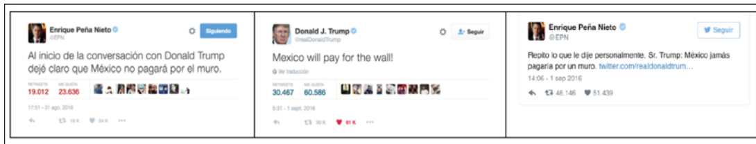
Figure 2. The discursive dispute over the border wall.

made it clear that Mexico will not pay for the wall". Twitter became a weapon to settle issues that could have been resolved using diplomacy (Figure 2).