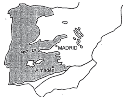
Figure 1.- Location of Almadén in a geological sketch map of Iberia. Shaded: Iberian Variscan chain.

The stratigraphic record of the area comprises several packages of black shale and sandstone/quartzite units, including frequent intercalations of submarine mafic alkaline volcanic rocks with ultramafic xenoliths, diatreme-type intrusive breccias observed throughout the stratigraphic column, and intrusive dolerites of tholeiitic affinities. An interesting feature of the Almadén magmatism is its high CO 2 content. Most of the basic volcanic rocks in the district display CO 2 values from 8 to 15%, reaching values as high as 20% and 30% (basalts and ultramafic xenoliths, respectively) (Higuera, 1995). Although these values could be of secondary origin, the fact of the high explosivity of the volcanism (recorded all along the stratigraphic record; diatreme intrusive breccias), together with the isotopic