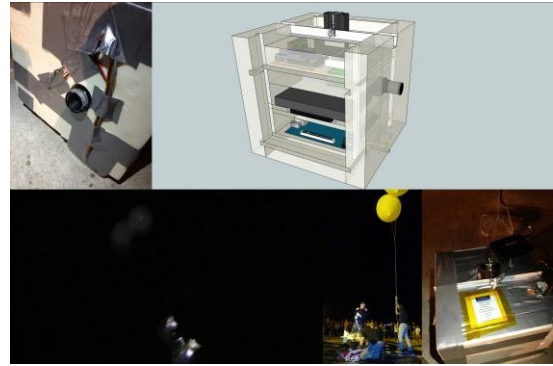
Figure 4. Launch images: (Bottom, left, center) D8 Draconids: two balloon configuration . D12-Geminids: (Up right) configuration diagram. (Up left) Watec 902H2 + Avenir 12mm F1.2. (Bottom right) Recovering stick.

Conclusions: Video recording from the stratosphere using weather balloons is an excellent technique for meteor research. Apart from the launch and recovering problems associated to the technique, the lack of stability is the main disadvantage of this method. However it can be minimize and produce astrometrical measurable frames, beating detection capabilities of ground stations.