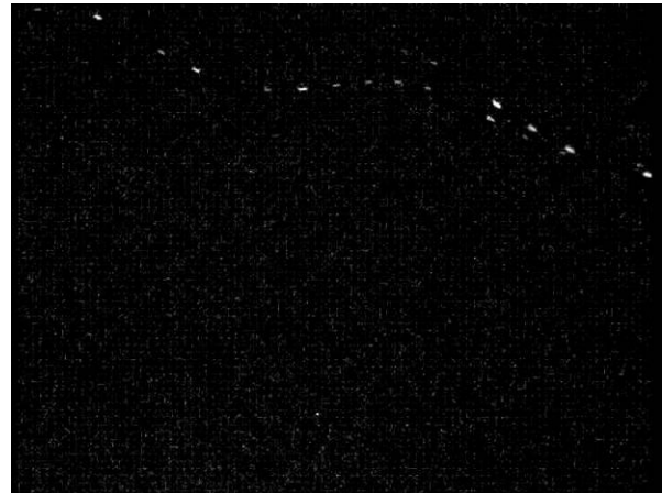
Figure 1. Composition of stack frames, with a bright star and a meteor trailing along the FoV in a wobbly phase of the flight (14 frames 1/50 s).

is illegal and we used models to estimate the probe position.