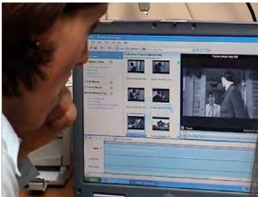
Figure 1: A student works with Windows Moviemaker to analyse sequences from Psycho

This project involves 13-year-old students analysing Hitchcock's celebrated slasher movie. In practical terms, they are provided with the film footage imported into Microsoft's free editing software, Windows Moviemaker. Because Moviemaker automatically splits long footage into brief clips, the students are faced with a screen full of small sequences (figure 1). They are then able to categorise these to explore themes, ideas (such as the fear inspired by horror films), characters, film grammar (they can sort all the close-ups, for instance), and so on. They are then asked to produce an oral presentation accompanied by a Powerpoint show featuring images, moving image sequences, sound files, script extracts and notes.